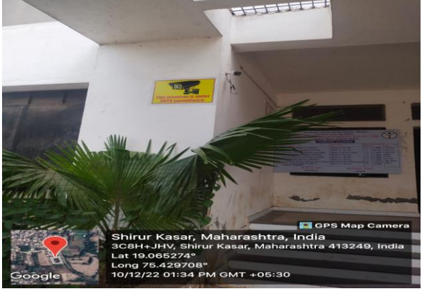
Health Care Facility