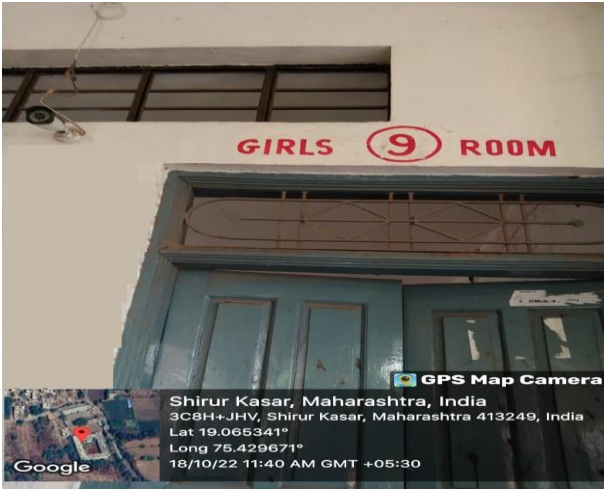
Health Care Center/ICC/Feeding Room