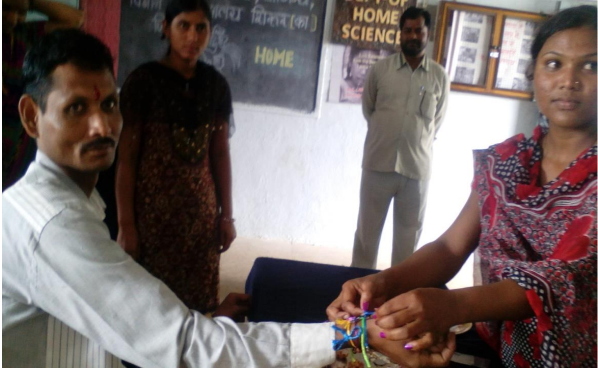
Celebration of Raksha bandhan