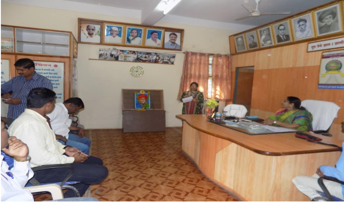
On the occasion of Mahatma phule birth anniversar