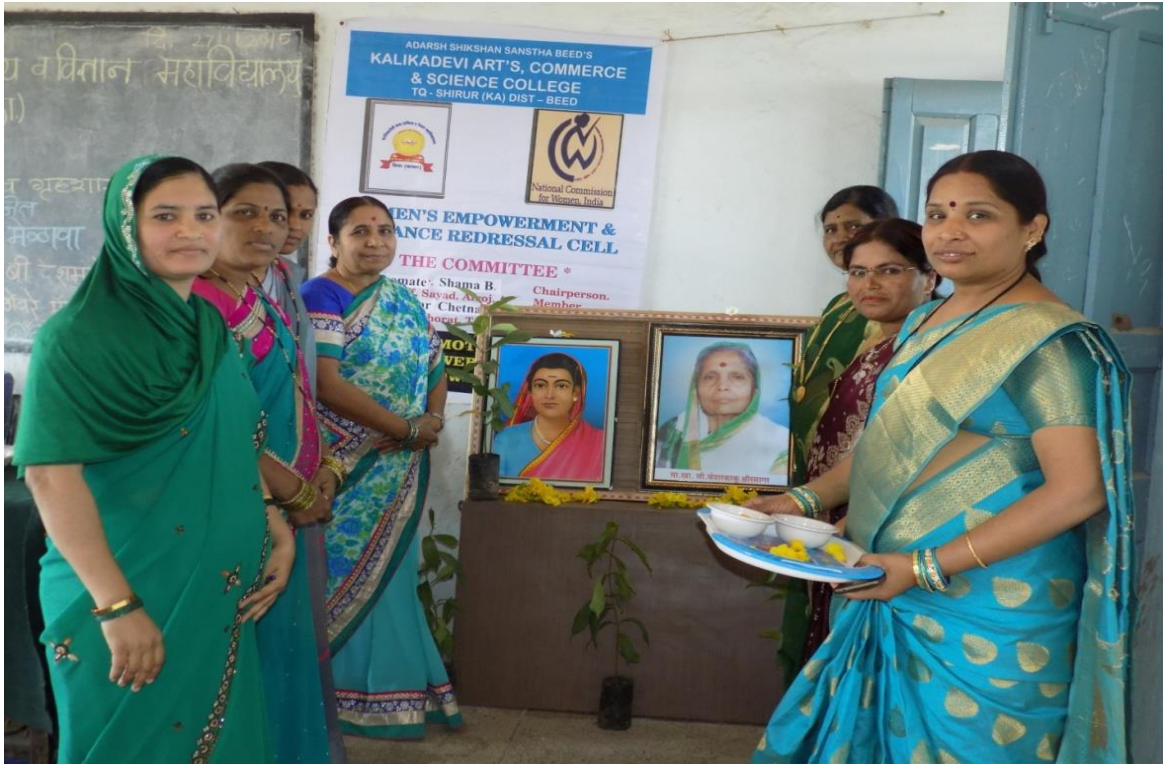
On the occasion of Haldi kumkum programme