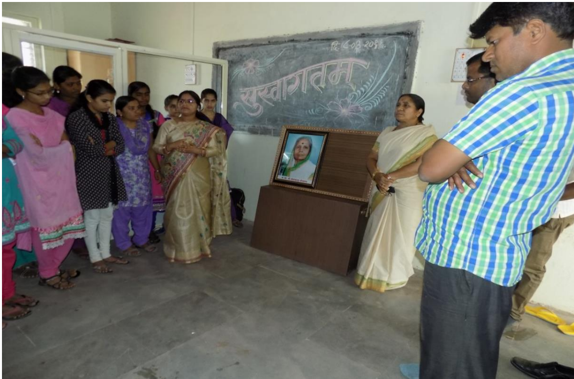
On the occasion of womens day