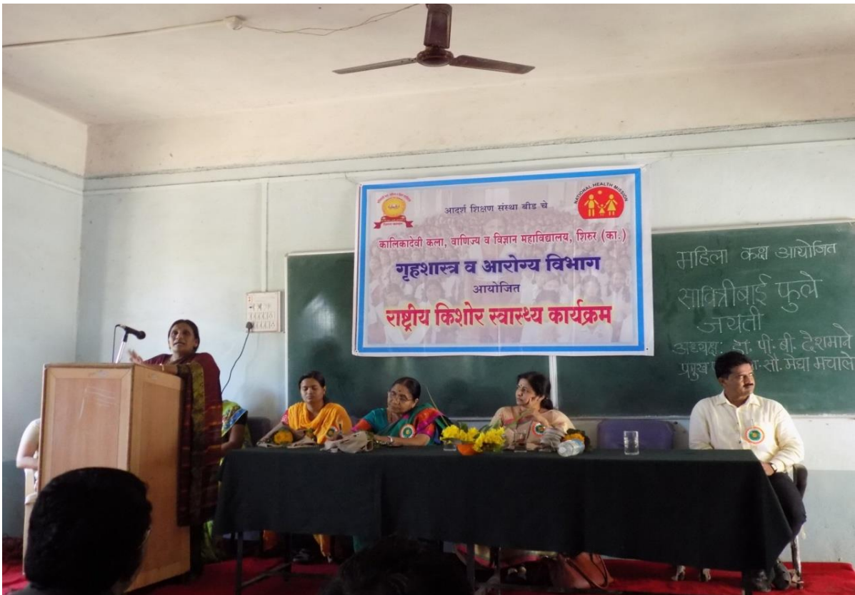
Savitribai phule Birth anniversary