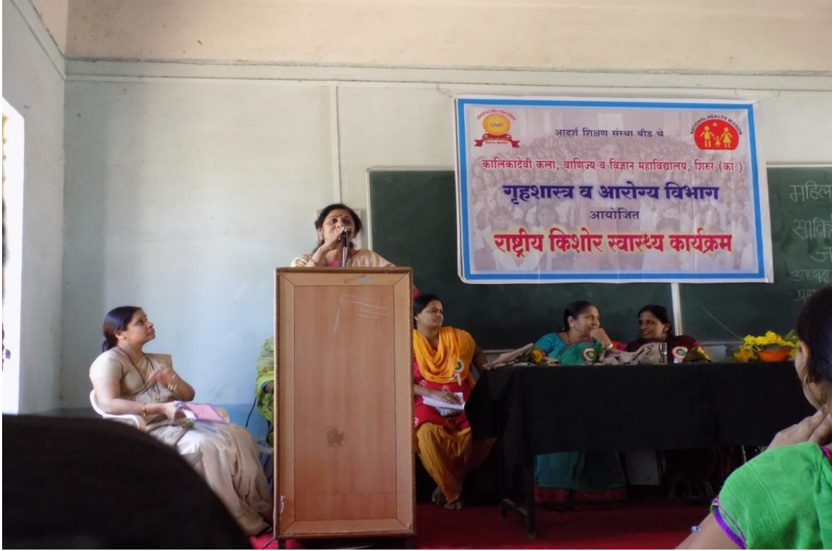
Savitribai phule Birth anniversary