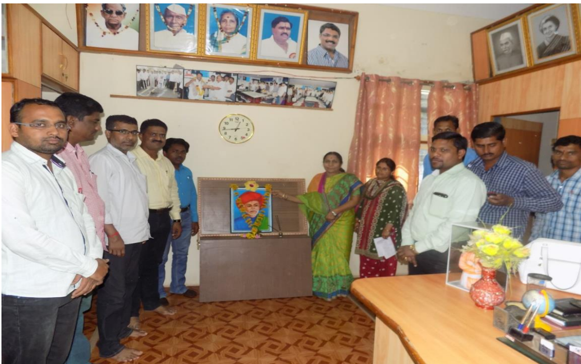
On the occasion of Mahatma phule birth anniversary