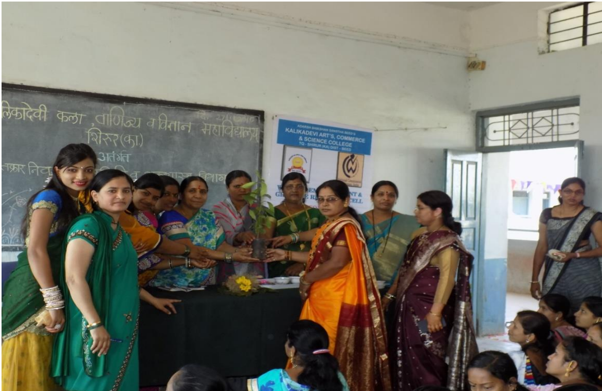
On the occasion of Haldi kumkum programme