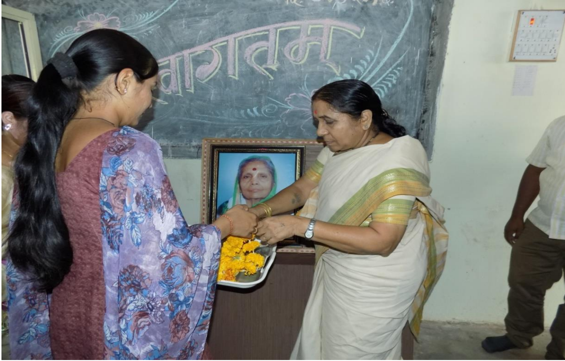
On the occasion of women's day