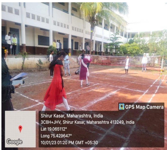
Shirur Kasar, Maharashtra, India 3C8H+JHV, Shirur Kasar, Maharashtra 413249, India Lat 19.065112° Long 75.429647° 10/01/23 01:20 PM GMT +05:30