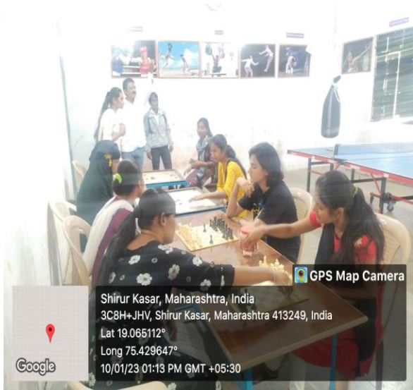
Shirur Kasar, Maharashtra, India 3C8H+JHV, Shirur Kasar, Maharashtra 413249, India Lat 19.065112° Long 75.429647° 10/01/23 01:13 PM GMT +05:30