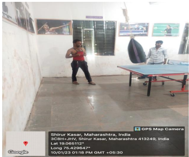
Shirur Kasar, Maharashtra, India 3C8H+JHV, Shirur Kasar, Maharashtra 413249, India Lat 19.065112° Long 75.429647° 10/01/23 01:18 PM GMT +05:30