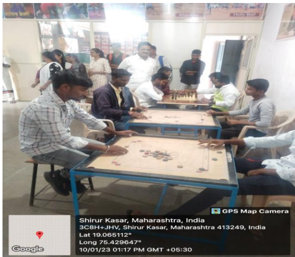
Shirur Kasar, Maharashtra, India 3C8H+JHV, Shirur Kasar, Maharashtra 413249, India Lat 19.065112° Long 75.429647° 10/01/23 01:17 PM GMT +05:30