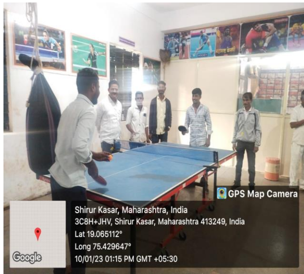
Shirur Kasar, Maharashtra, India 3C8H+JHV, Shirur Kasar, Maharashtra 413249, India Lat 19.065112° Long 75.429647° 10/01/23 01:15 PM GMT +05:30