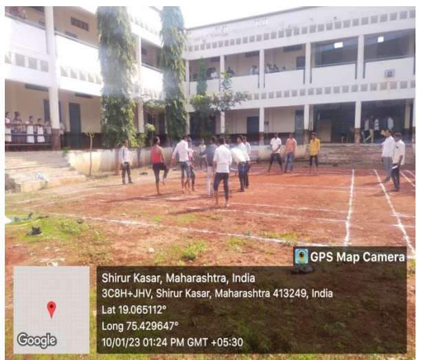
Shirur Kasar, Maharashtra, India 3C8H+JHV, Shirur Kasar, Maharashtra 413249, India Lat 19.065112° Long 75.429647° 10/01/23 01:24 PM GMT +05:30