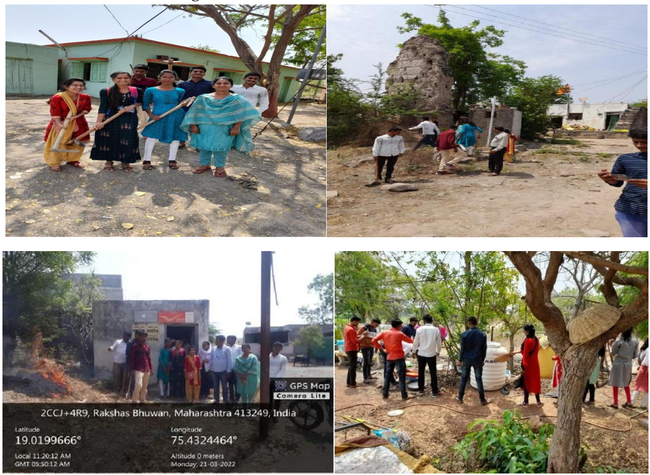
Volunt eers Shram daminvillage Rakshas a Bhuvan