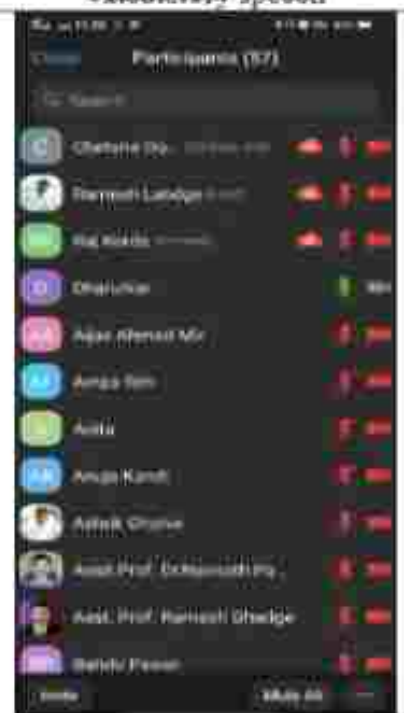
Participants for the conference