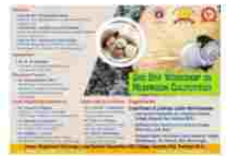
Department of Zoology Organize ONE DAY WORKSHOP ON MUSHROOM CULTIVATION.