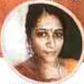
Dr. S. Marithai Sri S. Ramasamy Naidu Memorial College Sattur/Virudhunagar, (TN)