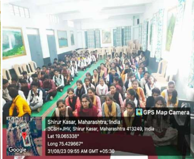
Shirur Kasar, Maharashtra, India 3CBH+JHV, Shirur Kasar, Maharashtra 413249, India Lat 19.065338° Long 75.429667° 31/08/23 09:55 AM GMT +05:30