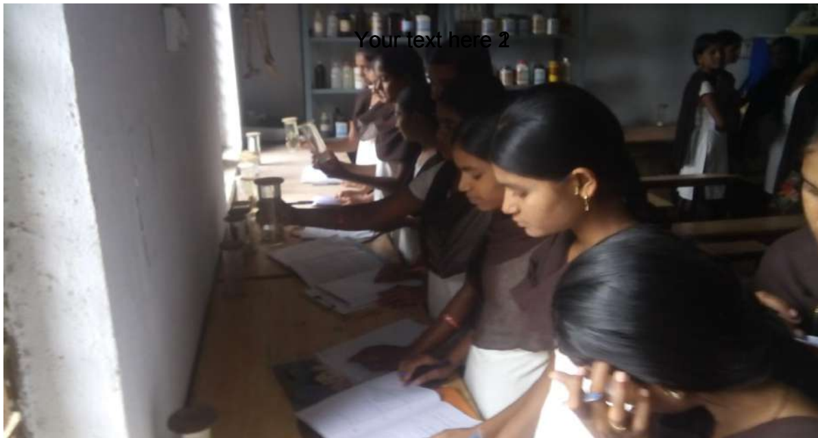
The facility of zoological museum showing to the local high school students and information were given by faculty of Department