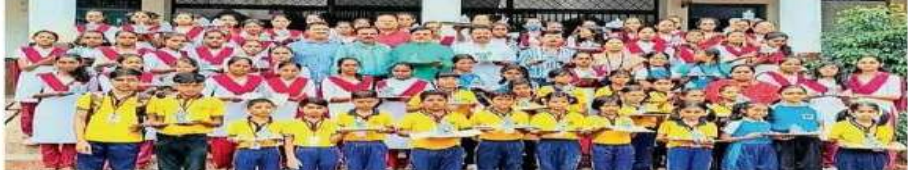
शिरूर कासार येथील कार्यशाळेत १०० विद्यार्थ्यांनी सहभागी होऊन गणेश मूर्ती तयार केल्या.