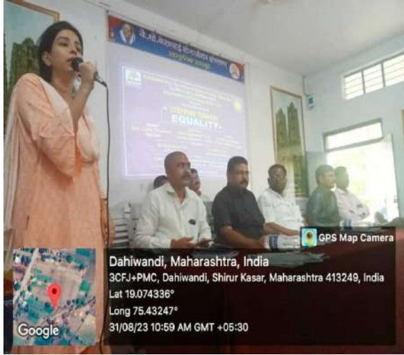
Dahiwandi, Maharashtra, India 3CFJ+PMC, Dahiwandi, Shirur Kasar, Maharashtra 413249, India Lat 19.074336° Long 75.43247° 31/08/23 10:59 AM GMT +05:30