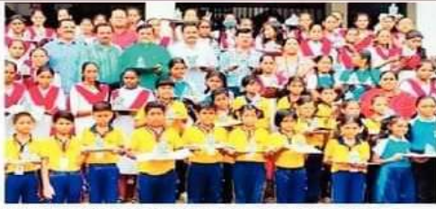
शिरूर कासार येथील कालिकादेवी महाविद्यालयात आयोजित करण्यात आलेल्या कार्यशाळेत विद्यार्थ्यांनी बनवलेल्या इको फॅडली गणपती मूर्ती.