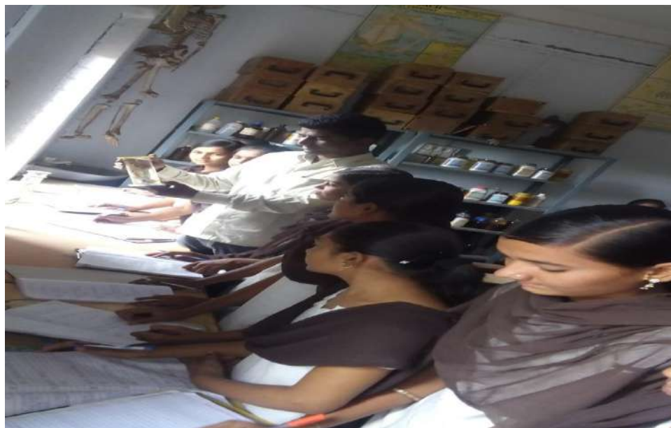
The facility of zoological museum showing to the local high school students and information were given by faculty of Department