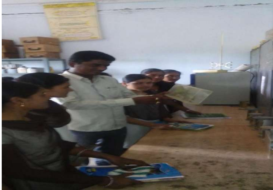
The facility of zoological museum showing to the local high school students and information were given by faculty of Department