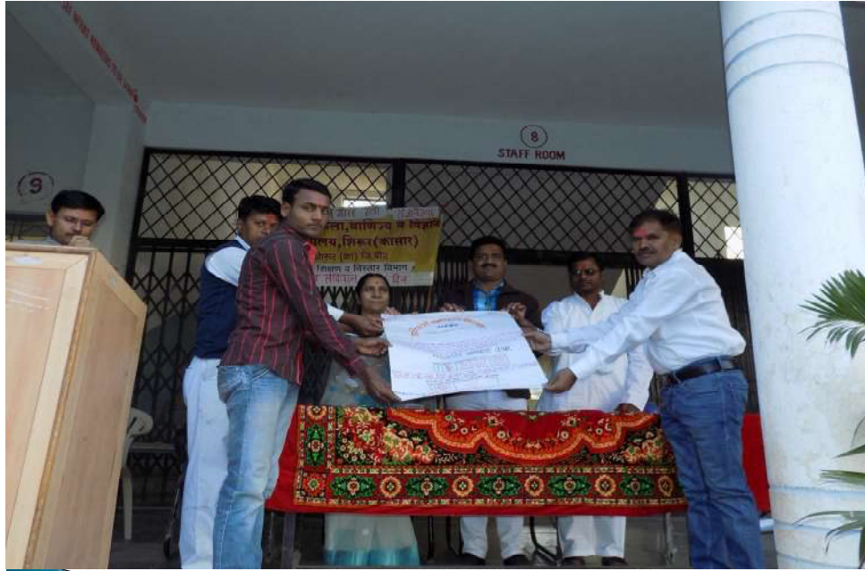
publication of Wall-paper