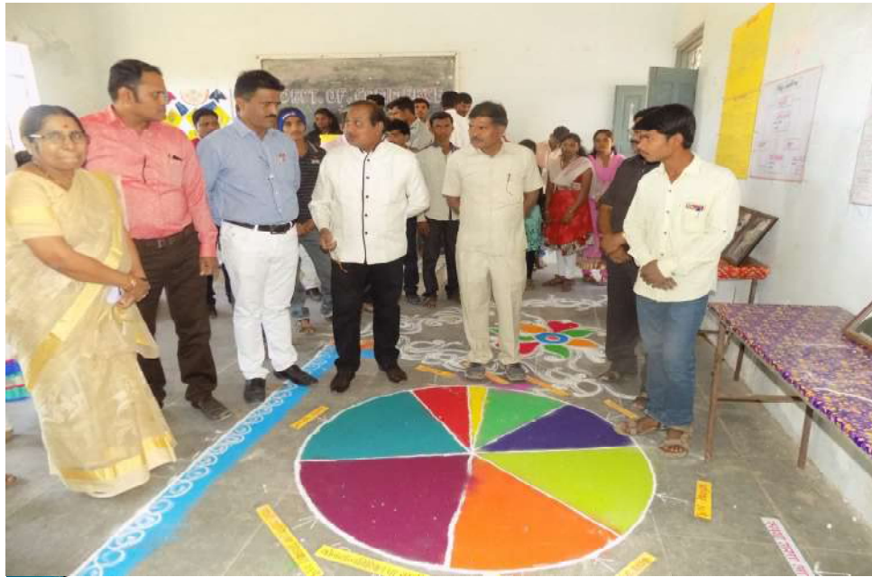
On The Occasion of Social Exhibition