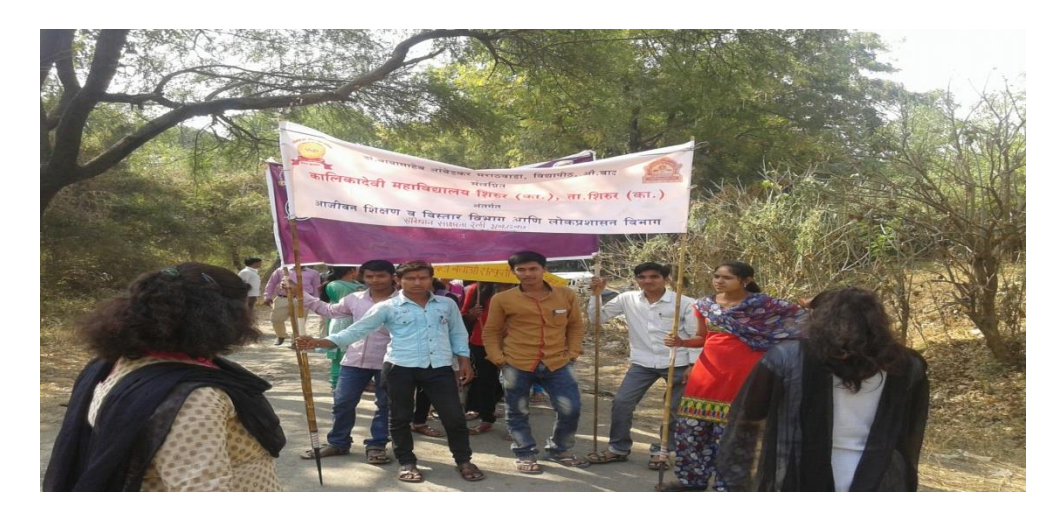
Lifelong learning & Extension & pub-Admn.Dep. Organized Constitution literacy Rally in Padali village. Dated 3 Feb.2017