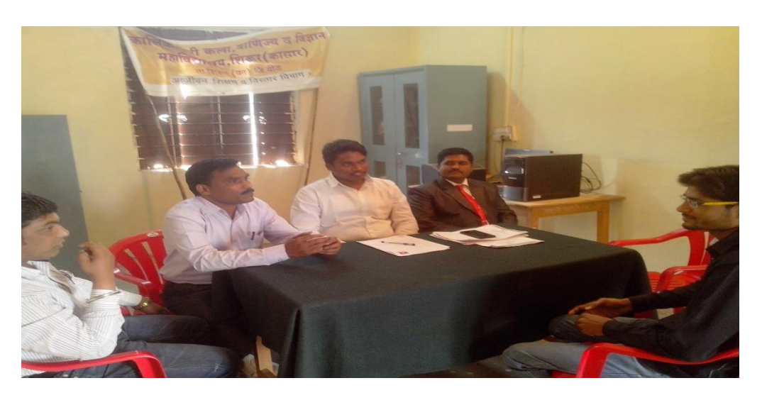
Lifelong Learning & Extention & Pub-Admn. Campus Interview of ICICI Bank in College