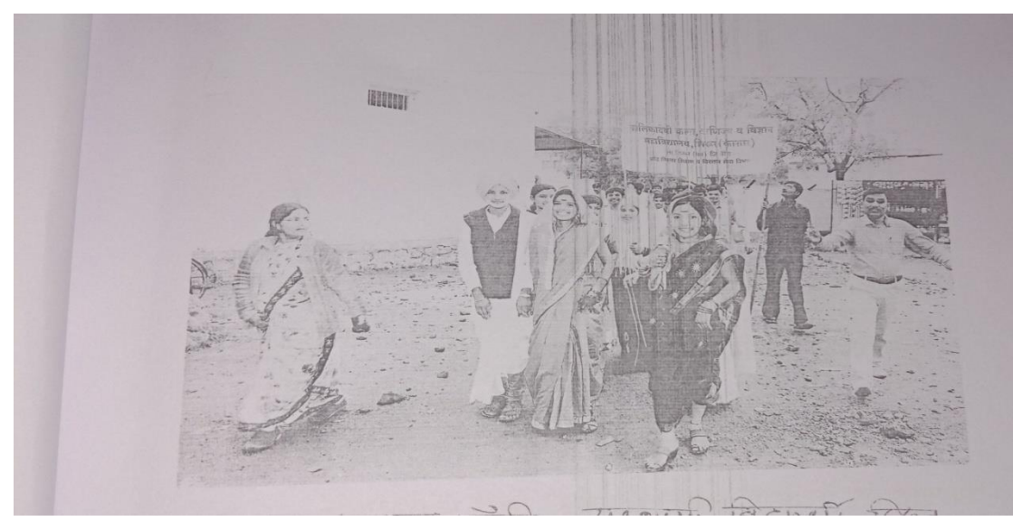
3 Jan.2015 Rally on Women Rights village in Shirur (Kasar)