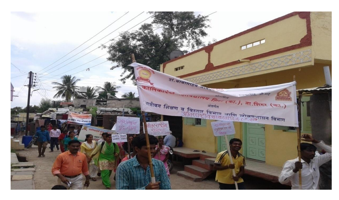
8 <sup>th</sup> September 2017 - On the occasion of International Literacy Day, Public-Admn. Department and Lifelong Learning Department organized Literacy Rally in Shirur ka.