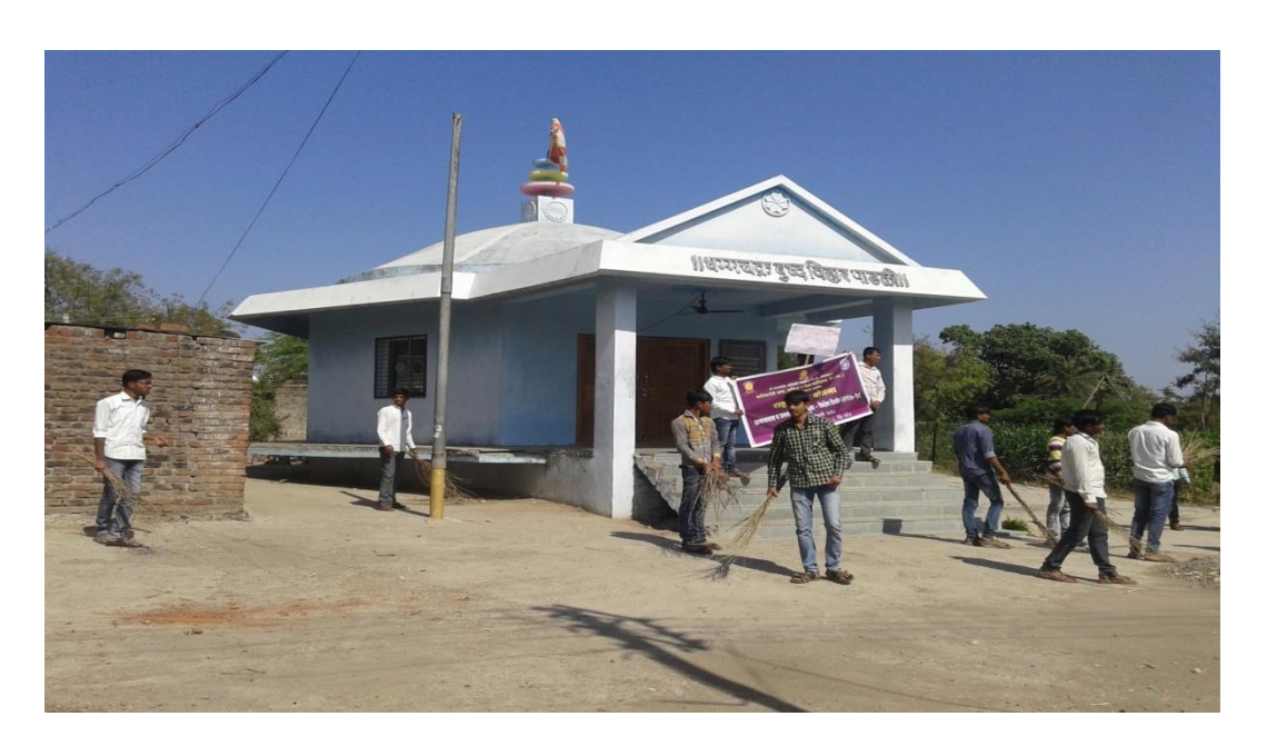
Gramswachata Abhiyan "Buddh Vihar" Padali village