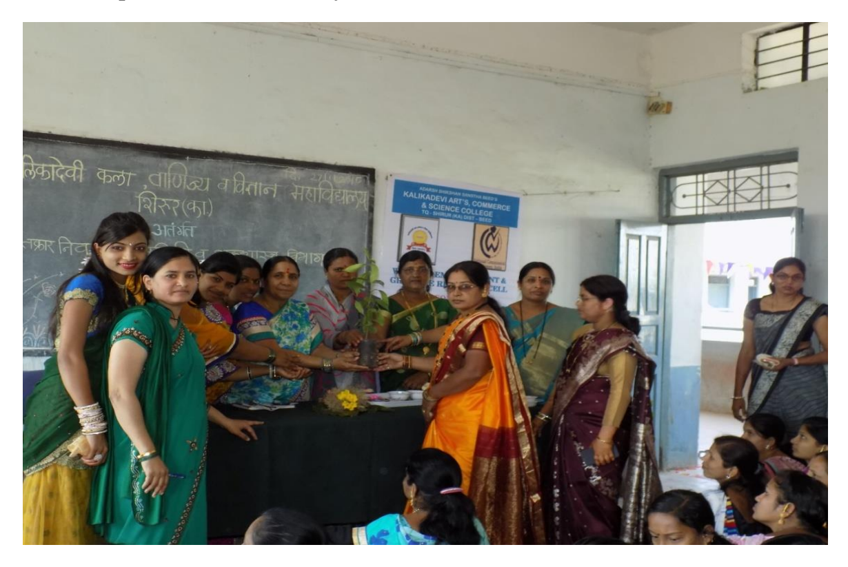
On the occasion of Haldi kumkum programme