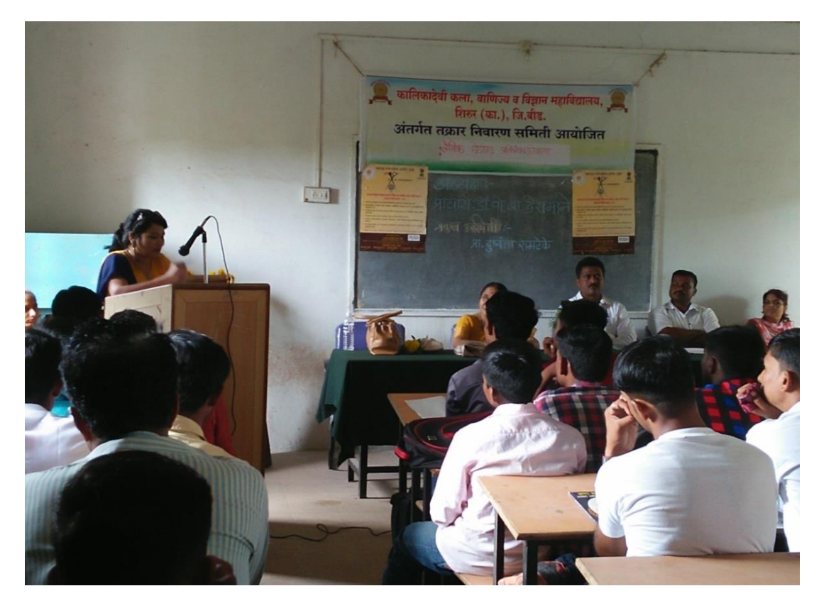
Sexual Harassment causes & precaution Programme