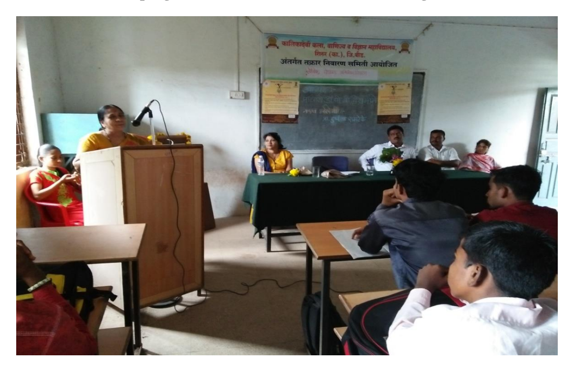
Women sexual Harassment programme

School interaction progamme on Child health at Padali Village